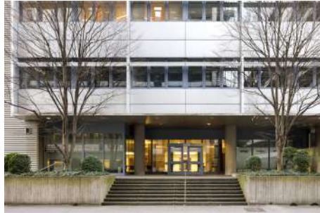
Exterior view, reception area