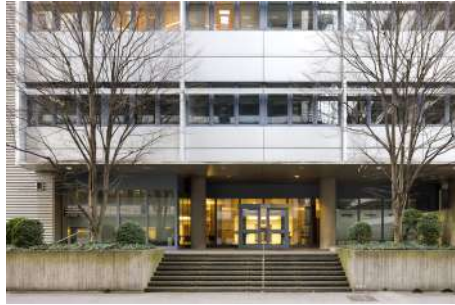
Exterior view, reception area