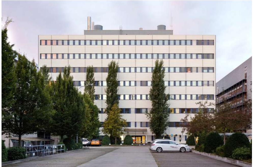
Exterior view 1

The property is situated within a closed site. The following companies are currently located in the building: BASF Schweiz AG, Idemitsu OLED Materials Europe.