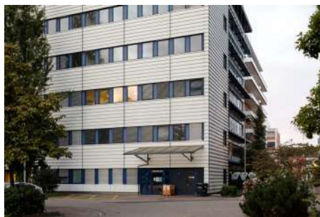
Exterior view 2

The property is situated within a closed site. The following companies are currently located in the building: BASF Schweiz AG, Idemitsu OLED Materials Europe.