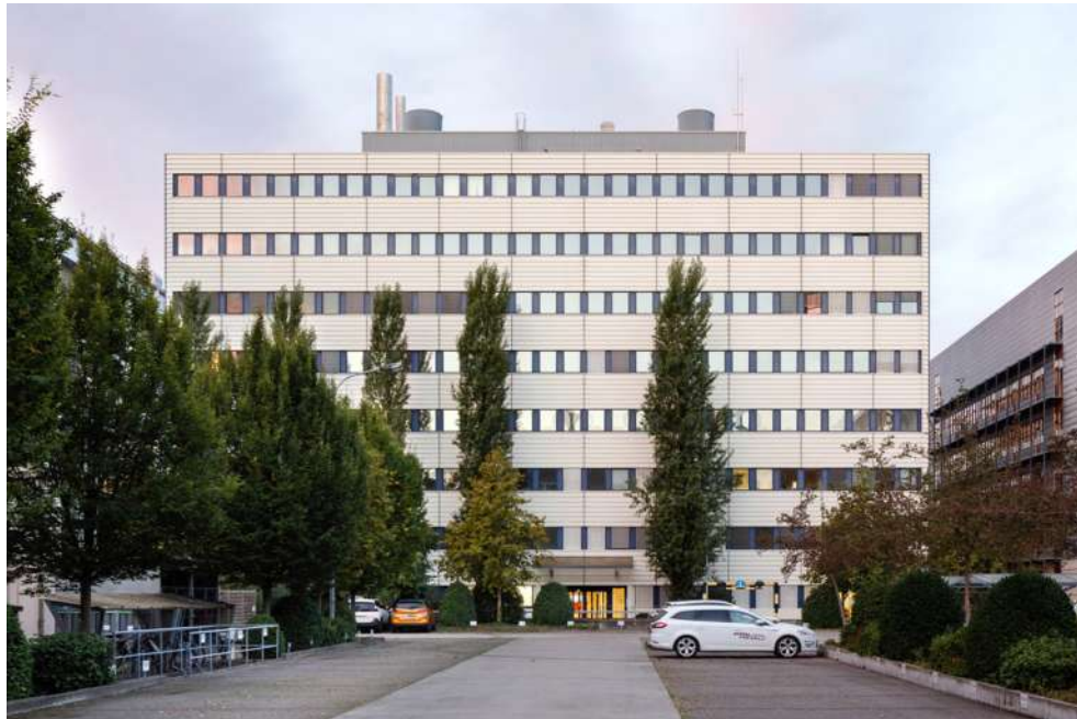
Exterior view 1

The property is situated within a closed site. The following companies are currently located in the building: BASF Schweiz AG, Idemitsu OLED Materials Europe.