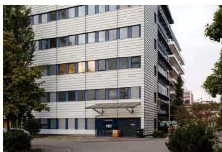
Exterior view 2

The property is situated within a closed site. The following companies are currently located in the building: BASF Schweiz AG, Idemitsu OLED Materials Europe.